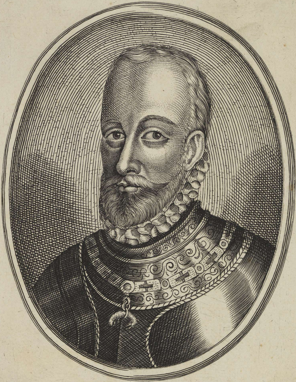
AMVRATH COMTE D'EGMONT.