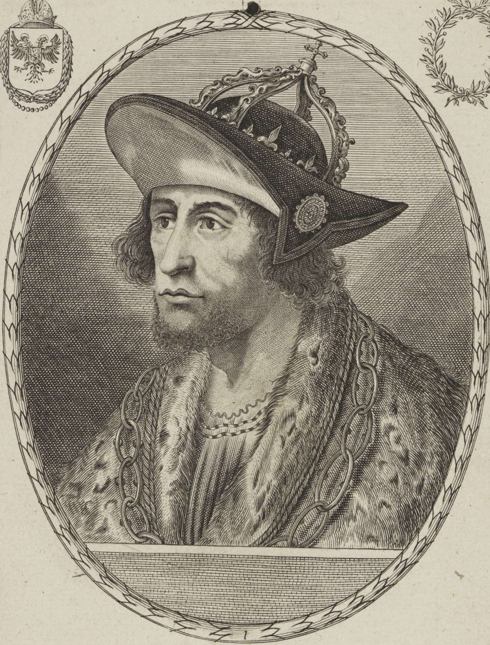
ADOLPHVS NASS A VIVS, ROM. IMPERATOR, etc.