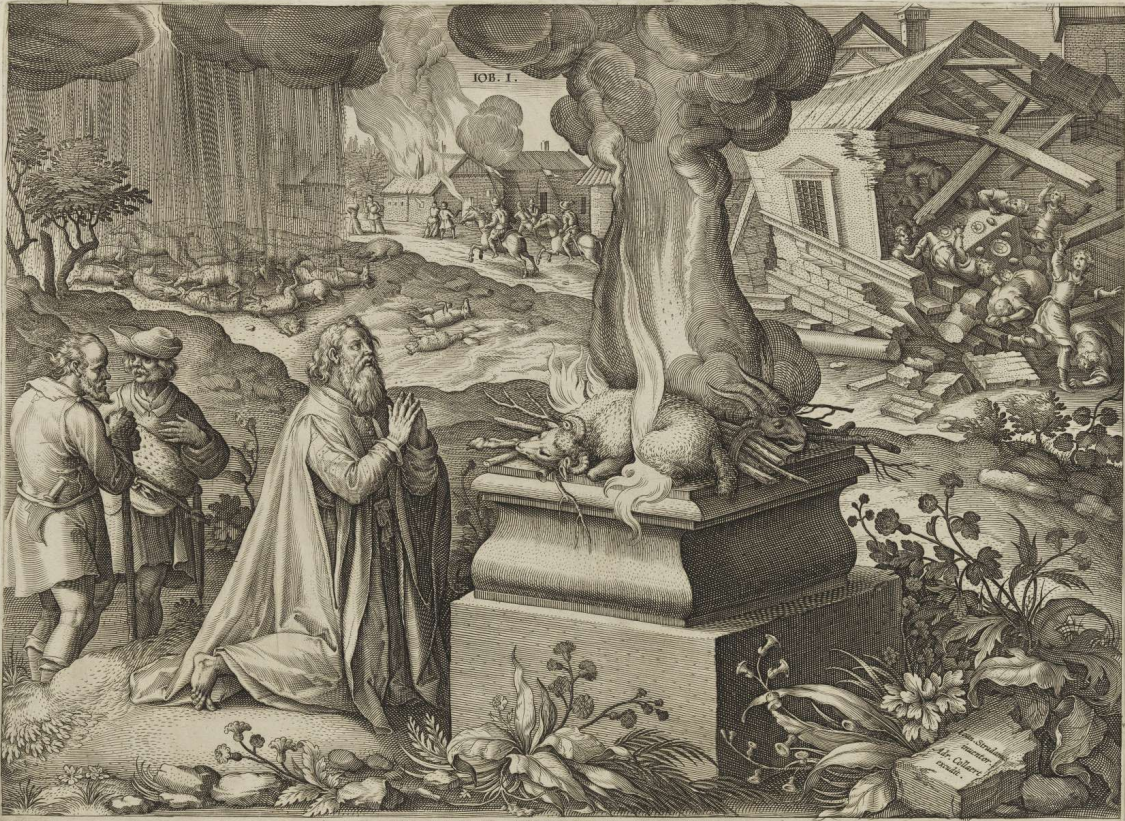
SPIRITVS TIMORIS DOMINI. Cor delectabit Domini timor, atq; dierum Ecclijfigl. 1. 12. Vitæ homini spatium, lætitiarq; dabit. C. XL D.