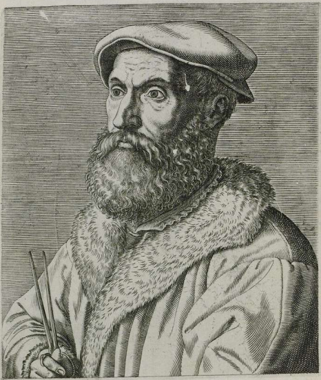
NICOLAUS TARTAGLIA, BRIXIANVS.

Divitijs patriæ cumulat Tartaglia lingue, Euclidem Etrusco dum docet ore loqui. Hic certam tractare dedit tormenta per artem, Et tonitru, & damnis æmula fulmineis.